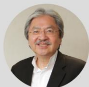
John C Tsang